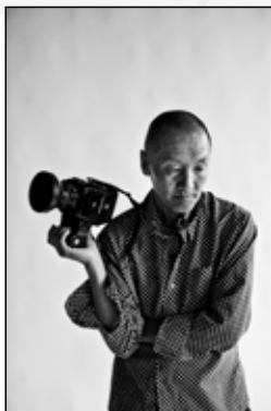
Wing Young Huie